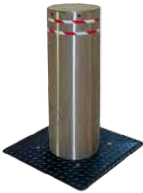
SUPER BULL INOX

SHATTERPROOF, HYDRAULIC BOLLARDS FOR THE PROTECTION OF HIGH SECURITY AREAS, PARKING AREAS AND PUBLIC ACCESS